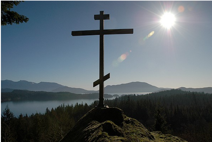
Thanks you for your prayers!