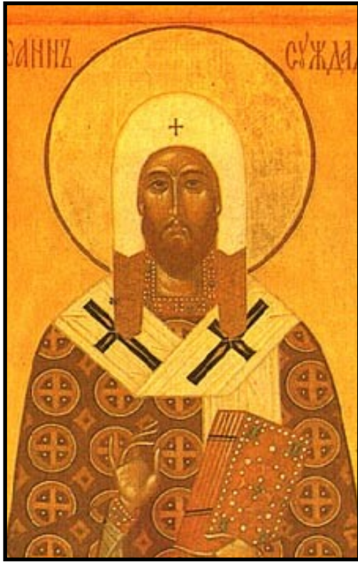
Icon of St. John of Suzdal whose memory we commemorate today.